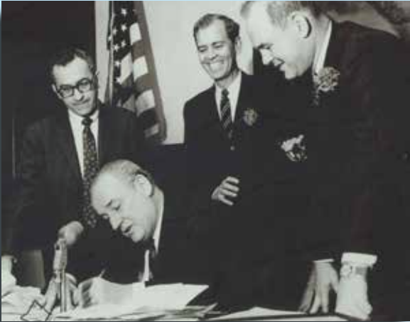
Gov. Winthrop Rockefeller signing the Arkansas Freedom of Information Act into law on February 14, 1967.